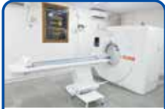
Rotary Rajkot Greater CT Scan Centre at BT Savani Kidney Hospital